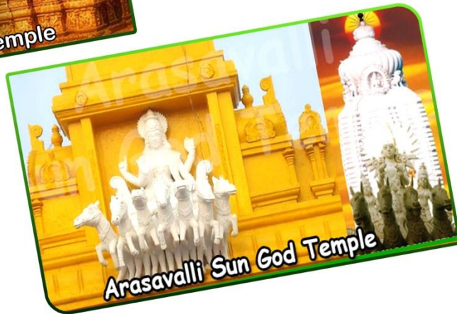
Arasavalli Sun God Temple