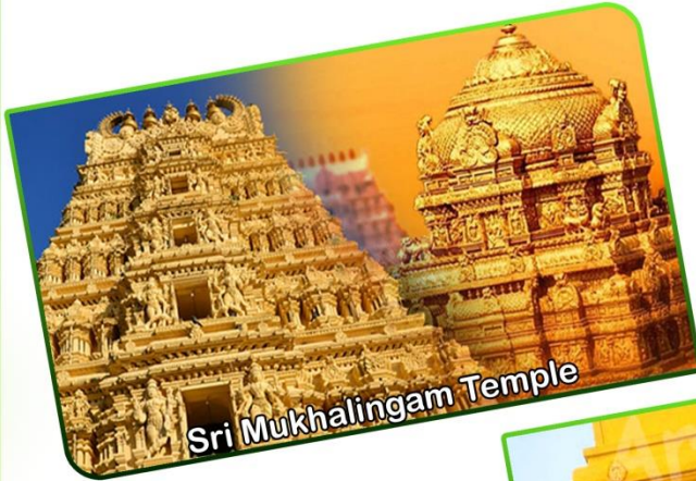
Sri Mukhalingam Temple