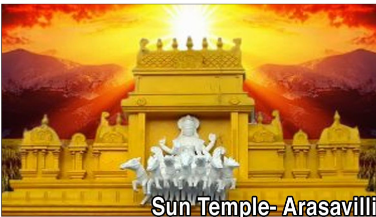
Sun Temple- Arasavilli